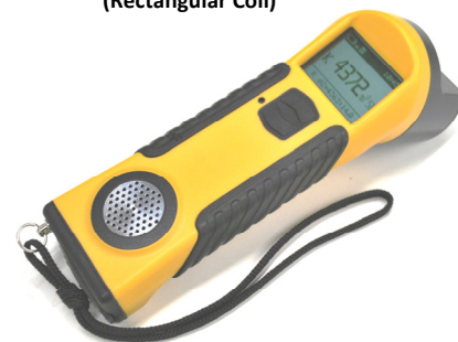
KT-10 v2 (Rectangular Coil)