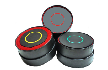
Conductivity Reference Pads