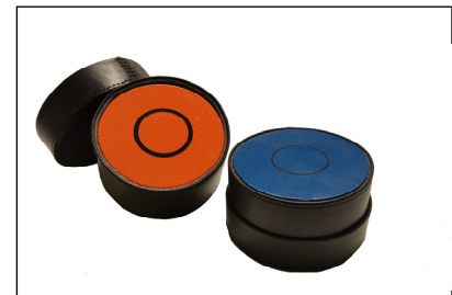
Magnetic Susceptibility Calibration Pads