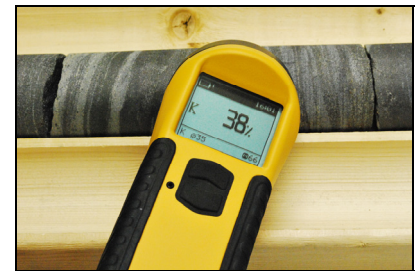
KT-10 Plus v2