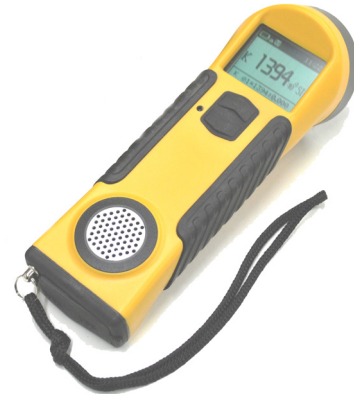
KT-10 v2 Magnetic Susceptibility Meter (Circular Coil)