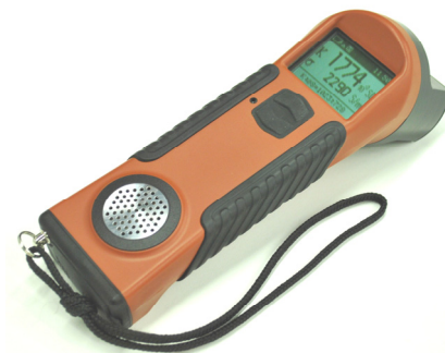
KT-10 S/C Magnetic Susceptibility/Conductivity Meter (Rectangular Coil)