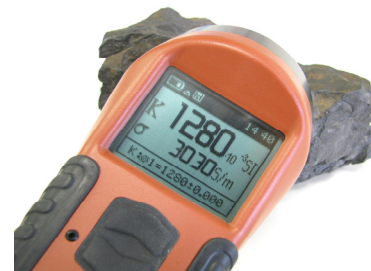
KT-10 S/C (Circular Coil)