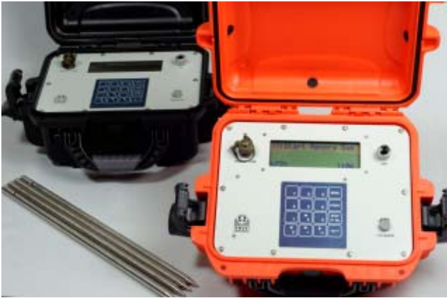
I-Full Waver , compact recorder for full wave signal